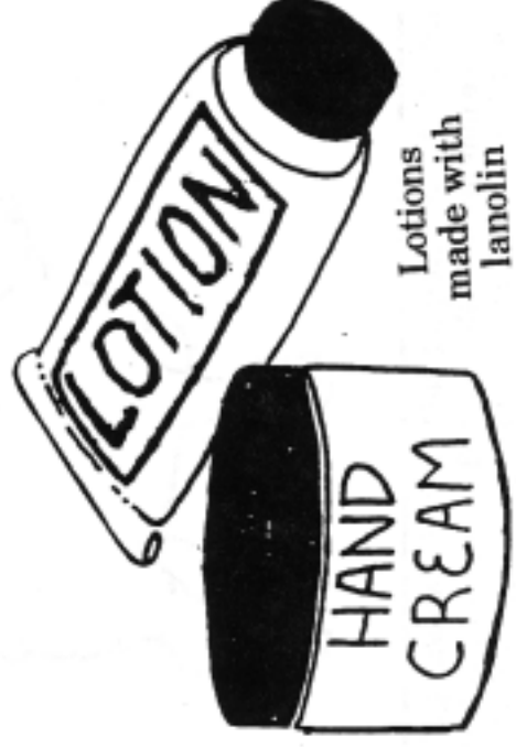
Lotions made with lanolin